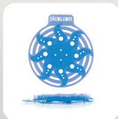
Fresh Scent Blue