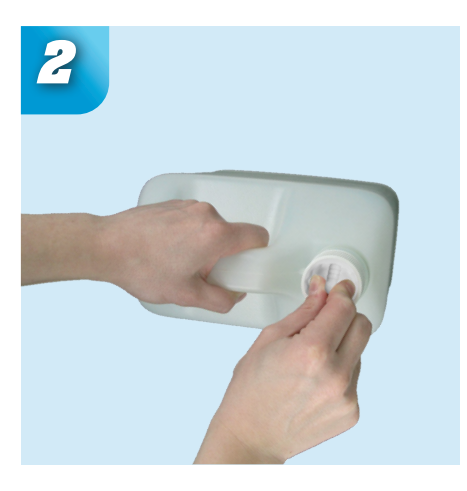
Position delivery cap on to the product and push down firmly in the center.