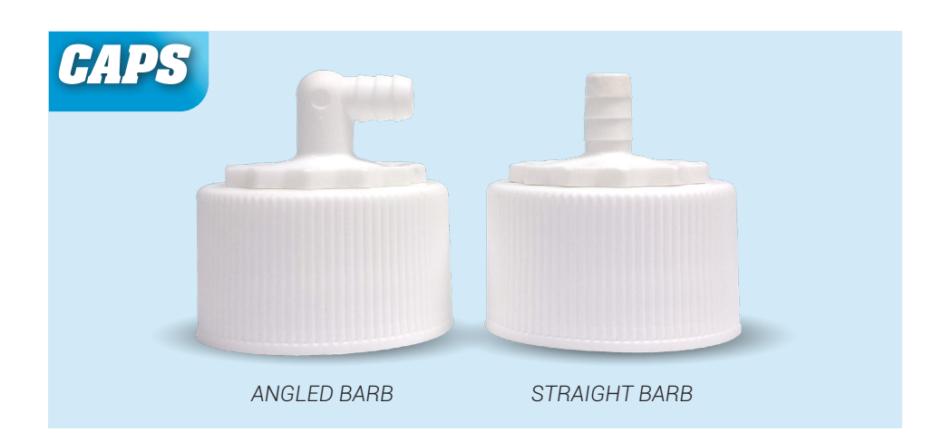
There are two different delivery caps available for use. The instructions for set up are the same for both caps. Angled Barb Connection Cap SKU D5722491 Straight Barb Connection Cap SKU D6081606