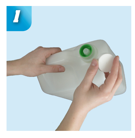
Remove shipping cap from the product by twisting off.