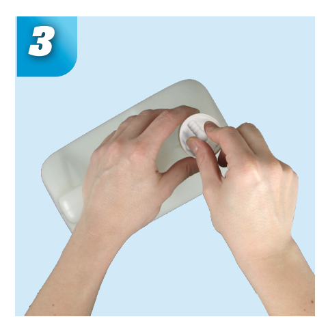
While pushing down, screw the cap tight. Position the barb towards its connection tubing.